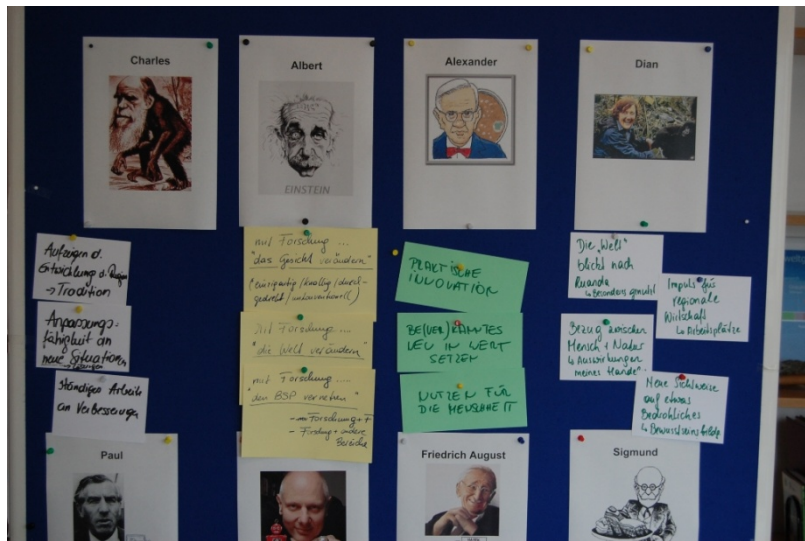
Figure 2: What would these scientists find interesting about the National Park? – Workshop design for the research agenda.

The central questions are answered in specially designed intensive workshops, using partly creative and partly analytical processes (cf. GETZNER et al. 2010) (Figure 2). Different groups can be invited to collaborate depending on the requirements specified by the park management. The research concepts of seven parks are described below.